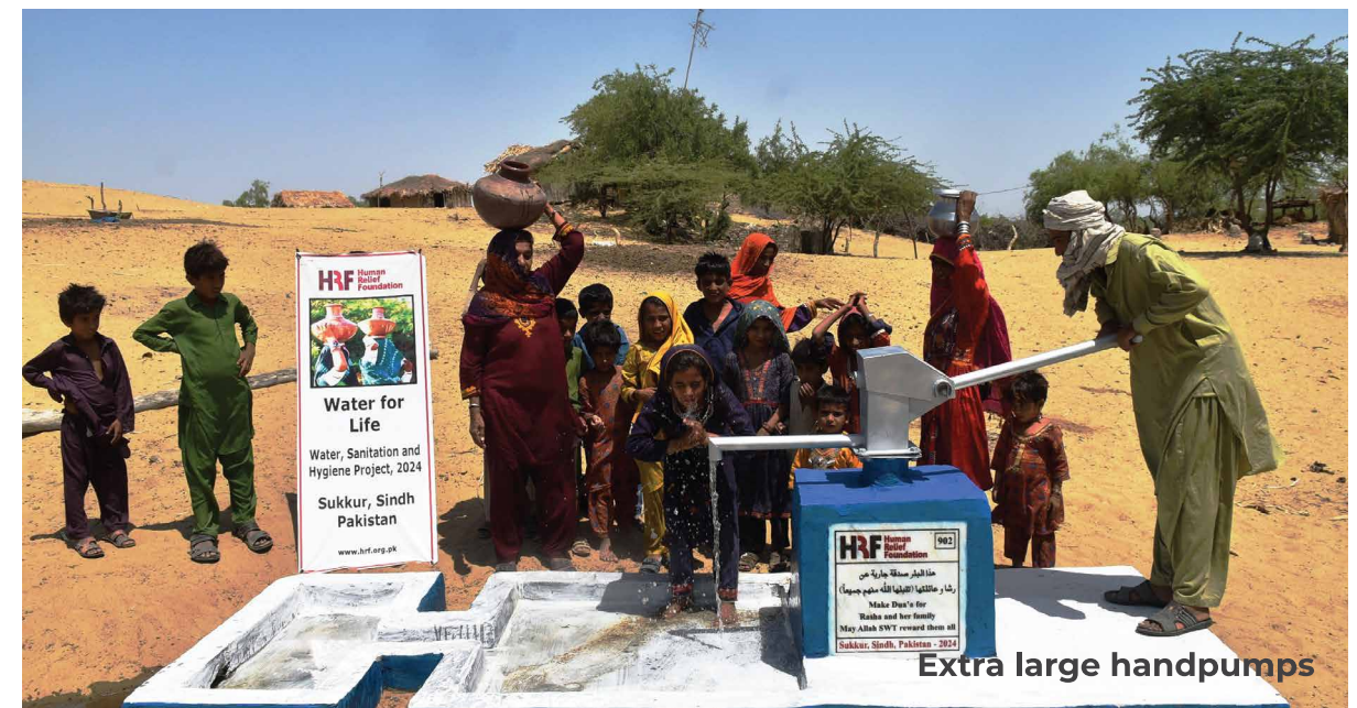
Extra large handpumps